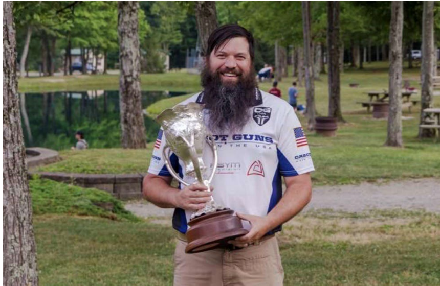
2025 Pistol Champion